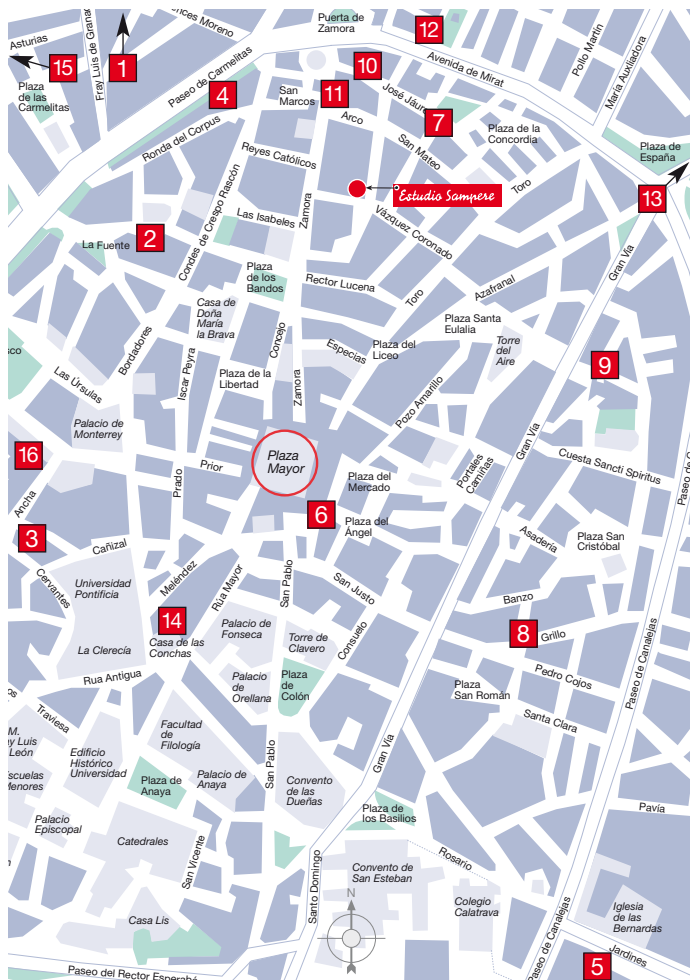
Mapa de Salamanca (área central)

At 9:00 am on the first day of the course, come to the School: Calle Vázquez Coronado, 9.